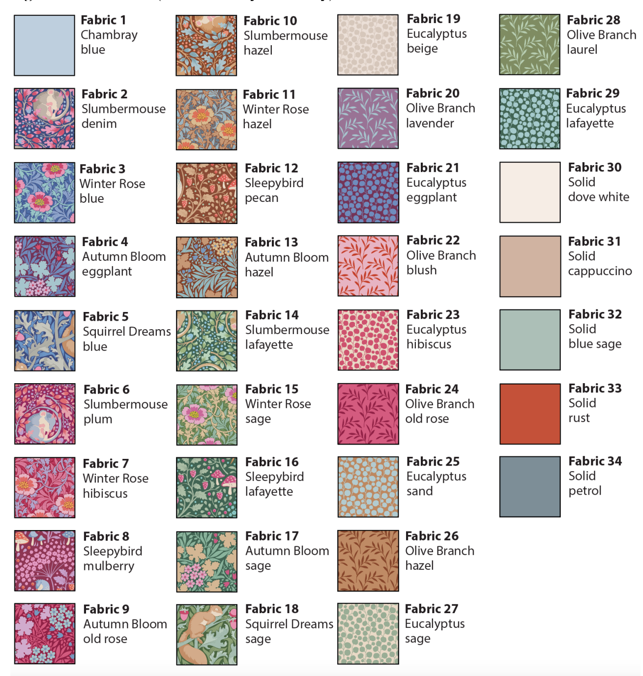
Fig A Fabric swatches (blue Chambray colourway)