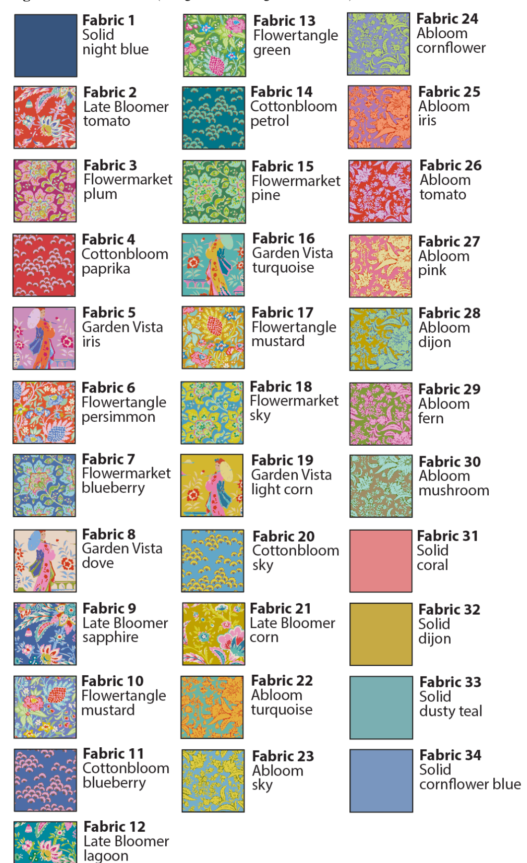
Fig A Fabric swatches (Mango Garden – night blue version)