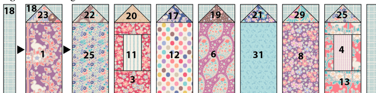
Fig A Assembling the house row

4 To make the house blocks, follow the quilt instructions (Steps 7 to 9). You will need six plain houses and two houses with a window. Once the houses are made, sew them together in a row with a 1½in x 8in (3.8cm x 20.3cm) piece of sashing at each end ( Fig A ). Press the seams in one direction.